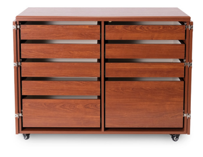
Dingo Cutting Table

Kangaroo sewing cabinet - check! Now complete your studio with Kangaroo storage and cutting furniture, specially designed to complement your primary workstation. With extra storage and workspace, you can customize your sewing room to be stylish, comfortable, and even more productive!