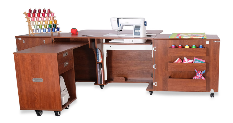
Aussie Sewing Cabinet