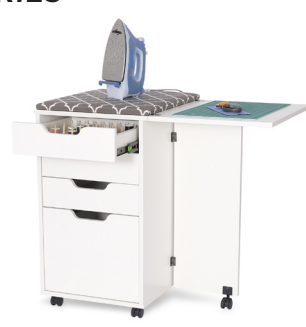
Kiwi Storage Cabinet

Every dream sewing oasis needs its cute, dependable accessories! Add even more convenience with a storage cabinet like Kiwi, featuring a built-in ironing board, cutting mat, thread drawers and a dedicated drawer to store your iron! Your dream sewing space won't be the same without it!