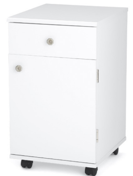
Suzi Storage Cabinet

There can never be too much storage space in your sewing room! Arrow's dedicated storage cabinets are designed for organization and accessibility. Arrow's Suzi , features 4 dedicated storage drawers and comes in Oak and White finishes! Cute and functional!