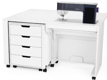
Laverne & Shirley Sewing Cabinet

Sewing cabinets provide comfort, easy set-up, dedicated storage for your machine and notions, different positions for better sewing posture and a spirited environment for crafting. Your machine deserves better than the dining room table! Sew in comfort, sew longer!