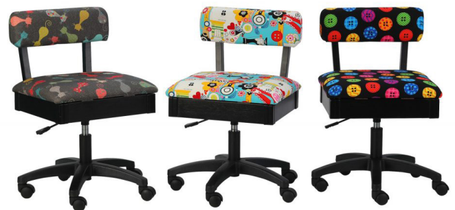
Cat's Meow, Sew Wow Sew Now & Bright Buttons Chairs

The cherry on top of your sewing sundae! Arrow's #1 Rated Height Adjustable Sewing Chair is a must have accessory for your dream sewing room! Cute, comfortable and convenient - our lovable chairs feature vibrant sewing themed patterns, 360° swivel access and lumbar support for long hours at your workstation. Don't look now, but under every seat cushion is a hidden storage compartment to store your notions and patterns! Available in 10 colors to perfectly match your sewing sanctuary!