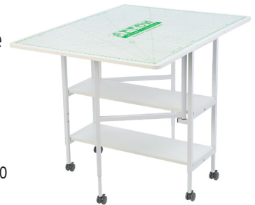
Dixie Cutting Table

Arrow sewing cabinet - check! Now add even more convenience to your studio with a dedicated cutting table like Dixie , specially designed to complement your primary Arrow sewing cabinet. Add style, storage and comfort to your growing sewing oasis!